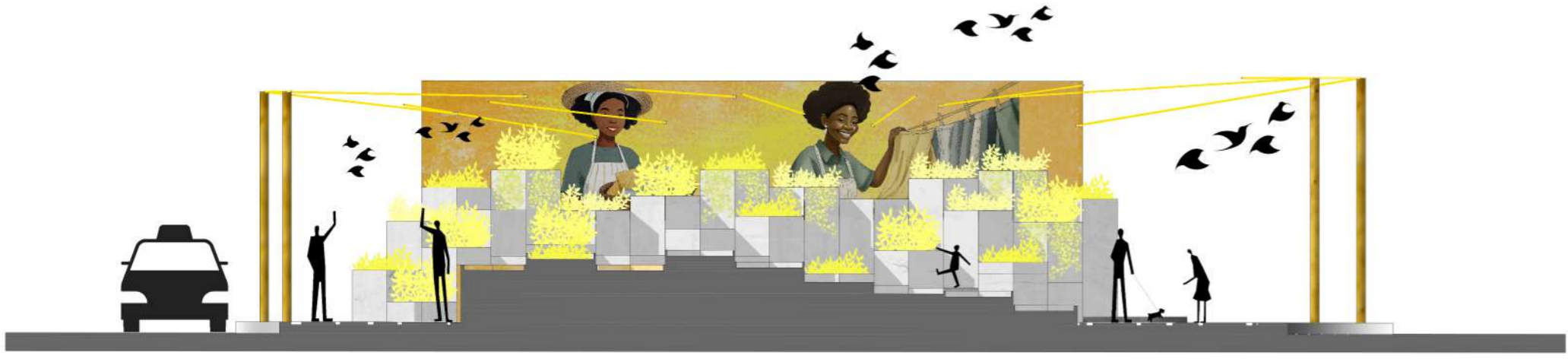
Corte A-A Escala 1:100